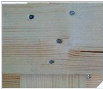
Top board centre block