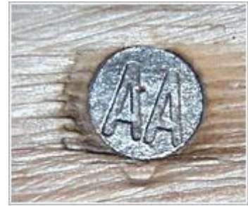
Two-letter spike head