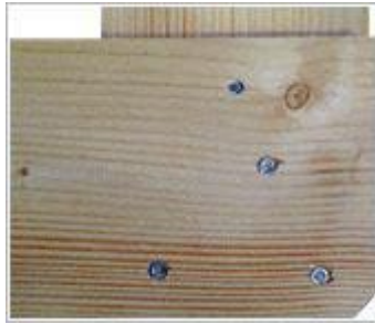
Top board left corner block